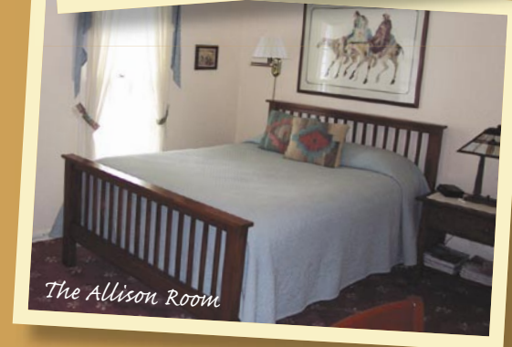
The Allison Room