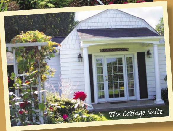
The Cottage Suite