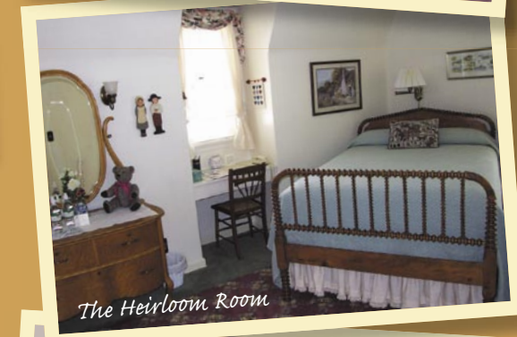
The Heirloom Room