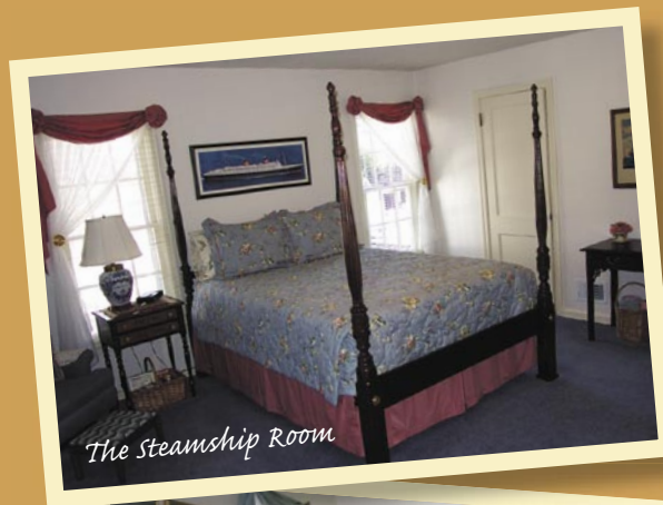
The Steamship Room