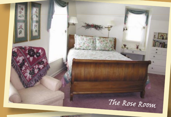
The Rose Room